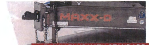
7-WAY PLUG WITH STANDARD WIRING