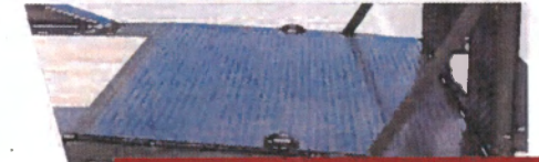
4 BULL-NOSE D-RINGS