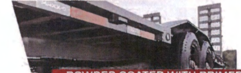
POWDER COATED WITH PRIMER STANDARD